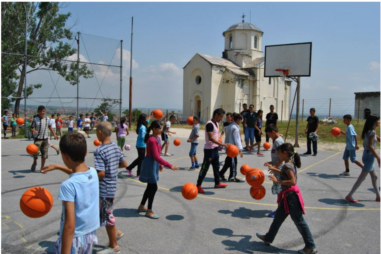
Photo from the summer program activities in SHLC

Each month, LC Coordinator and other staff were involved in organizing at least one meeting with the parents of the children attending our program. Each month, all 5 LC reached out to more than 50 different parents for these meetings, where different problems were discussed and different outcomes reached, all in regard to well planning and organizing programs for their children in our LC.